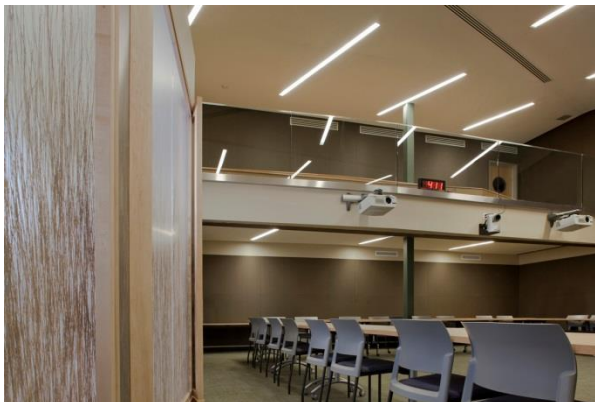
Google_6 – The large conference room is cleanly illuminated with recessed linear fluorescent slot luminaires whose orientation varies depending on the alignment of the articulated ceiling planes. The wall of grass in acrylic is backlit by daylight and a series of wall-washers.

composition and technical lighting elements like contrast and the spaces.