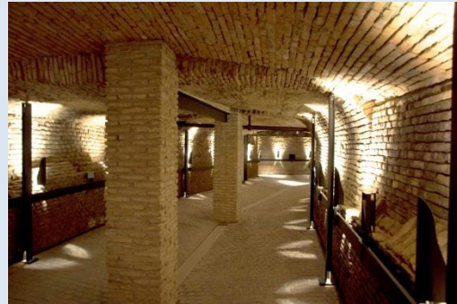
Fill Light Version