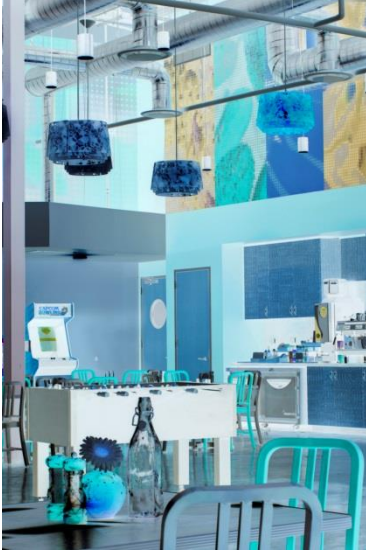
Google_7 – Decorative pendants in a variety of colors are staggered through the break room, creating a loose, relaxing environment. LED cylinder downlights provide task lighting on the countertops.