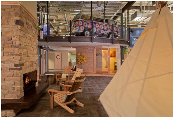
Google_5 – The shallow mezzanine uses the same luminaires, however these have only a direct distribution of light to localize it on the work surfaces, creating a more intimate feel. Casual work spaces are grouped by the fireplace. These spaces have a decidedly warmer and more intimate ambience than the open office work areas. A wood veneer pendant illuminates the log cabin conference room while recessed LED wall washers highlight the artwork on the wall. Adjustable low-voltage cable lights with LED MR-16 lamps crisscross the campfire area allowing users to adjust and aim the lights

to suit their needs and the seating arrangement. The teepee is illuminated from a cord and plug floor lamp.