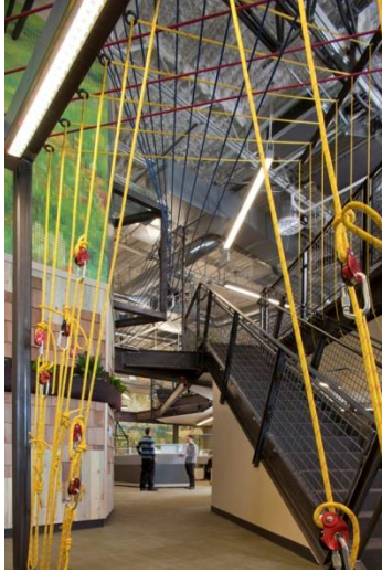
Google_4 – The luminaires are custom painted an aluminum color to relate to the industrial feel of the exposed systems. The linear lights often align with the linear pattern of the ropes, accentuating their flow and movement throughout the space.