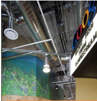
Photo Narrative: Please describe in 500 words the photos, referencing photo file name and how the project addresses the judging criteria.

Google_1 – The entry is lively with an array of items competing for visual interest. The backlit marquee signage juts into the space as a statement of arrival while a super-graphic draws attention to the volume of the space. Large-scale decorative pendants, whose style complements the raw industrial elements of the space, supplement the natural daylight providing general illumination. Round wall sconces relate to the porthole-style windows in the doors and line a corridor. The main hallway is understated; LED downlights provide general illumination and subtly highlight the plants on the wall.