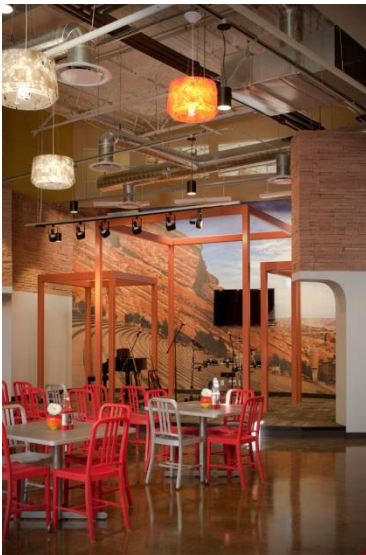
Google_8 – This space extends into a congregational area, which is a miniature replica of Red Rocks. Discrete fluorescent luminaires suspended above the structure illuminate the super-graphic of the amphitheater bringing it to life with dramatic effect.